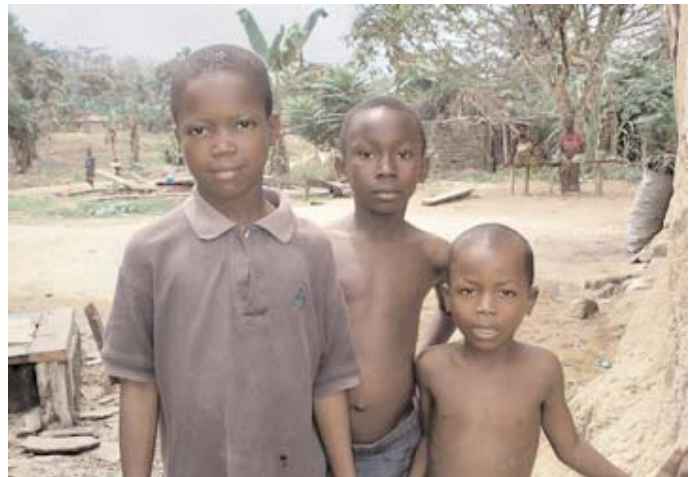
Three boys in Bong County, Liberia.

For many, returning home is the first of many steps in the healing process. For more than a year, CVT has worked in Liberia to help thousands of torture survivors, including