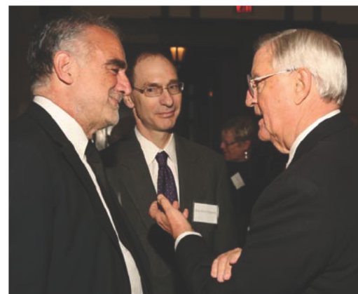
ICC Chief Prosecutor Luis Moreno-Ocampo and former Vice President Walter Mondale.