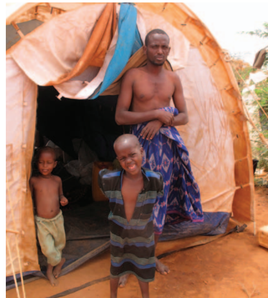
Somali refugees in Dadaab, Kenya.

In our international projects, group counseling gives survivors the space to talk about the unimaginable. At the end of their counseling sessions, a group of men from the Dadaab refugee camp stood in a circle holding hands. As they raised their hands they repeated, “Spirit is greater than force. We shall work together in our group to overcome this trauma and we shall prevail.”